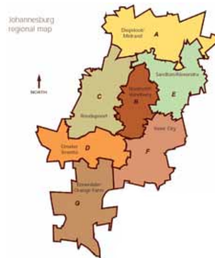
Figure 1: City of Johannesburg Metropolitan Municipality –Regions

The negative impact of past liquor regulations on communities, with specific reference to shebeens and the oversupply of liquor outlets in certain geographical areas is illustrated in a comparison between Region D and Region B in the City of Johannesburg.